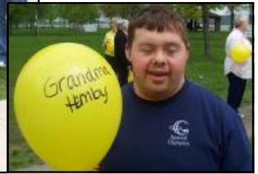
LIVESTONG Walk in Guttenberg